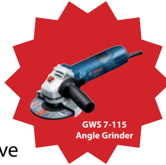
GWS 7-115 Angle Grinder